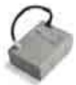
PS124 24 V battery with integrated battery charger. Pc/pack 1