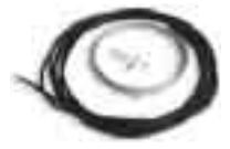
KA1 6 m cable release kit for KIO. Pc/pack 1