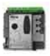
POA1 Spare control unit for PP7024.