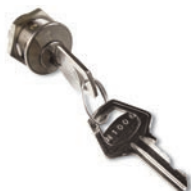
CM-B lock with two metal keys compatible with SELE