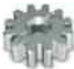
RUA12 12-teeth pinion, module 6, to be coupled with rack ROA81. The Run automation is supplied with a module 4 pinion to be used with the standard racks ROA7 and ROA8. Pc/pack 1